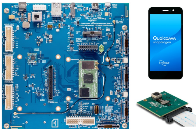
Optional Display and Camera